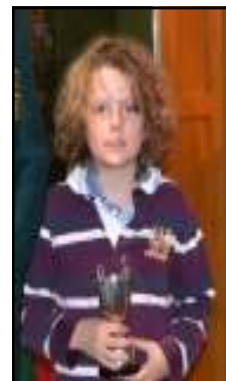
Alfie Hocking Rookie Trophy